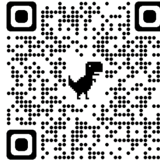
ORDER SHOUT-OUTS ONLINE

No cooking or barbecues are allowed anywhere on campus. There are no electrical hook-ups available in the parking lots. NO FOOD OR DRINK OF ANY KIND IS ALLOWED ON THE FIELD. ANY GROUP DOING SO WILL BE DOCKED 1.0 PENALTY POINT PER INFRACTION.