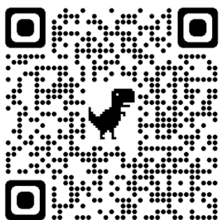
SRHS CONCESSIONS MENU

A nice variety of food items will be available for purchase at both stadium concession stands. Use the appropriate QR code to view the menu, order shout-outs, or view the program.