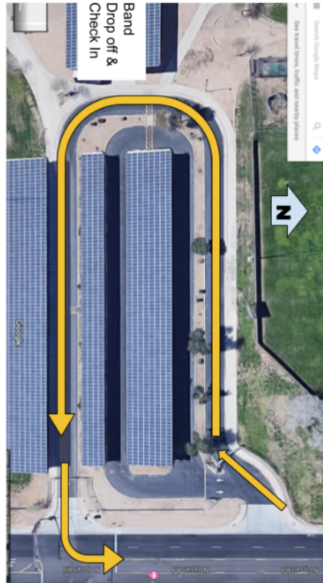
Bus and Trailer Map