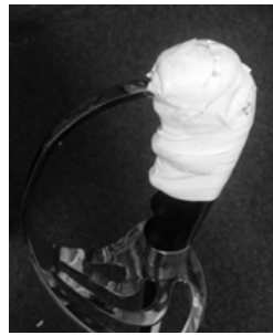
Good Saber Hilt