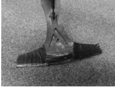
Good Pedal-Taped over edges

Most percussion instruments are on an appropriate frame with tires that do not pose a risk to the gym surface. If any frames/stands are set directly on the floor, they need to be appropriately covered/padded. Pedals that make contact with the floor should have edges taped with a few layers.