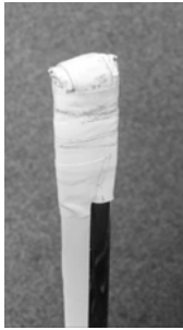
Good Saber Tape

Sabre Inspection – Sabers need to have a secured tip. There may be several variations on how this is done, it doesn't need to be excessive but the tip is required to be covered with a small padding. Single piece of tape is not enough. The bottom of the hilt where the screw is located must also be covered with tape.