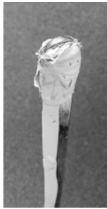
Bad Saber Tape