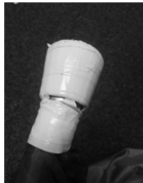
Bad Flag Tip – tip could fly off