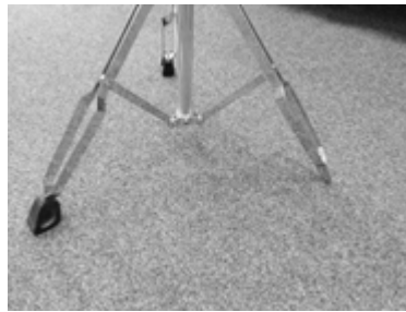
Bad Stand-Missing Rubber Foot