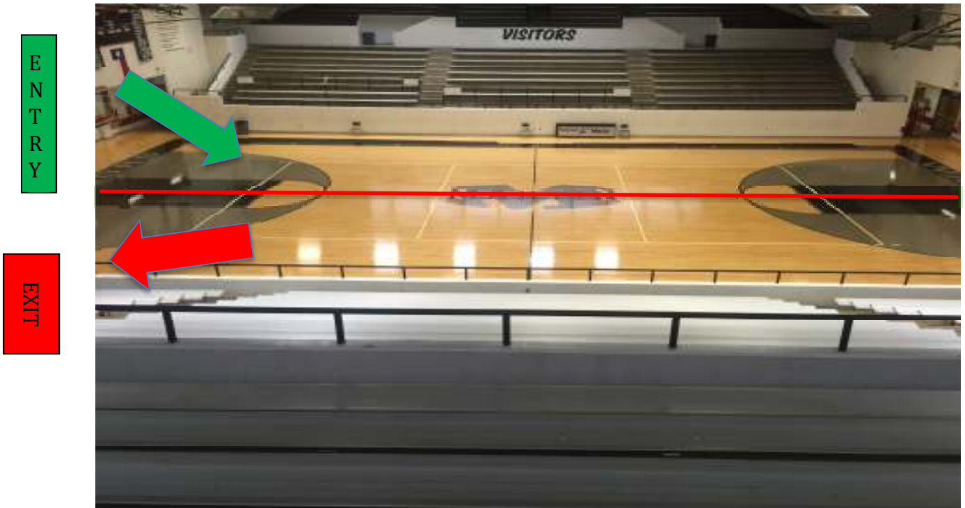
(THIS IS THE VIEW FROM THE GE JUDGES AREA/SPECTATOR SIDE)